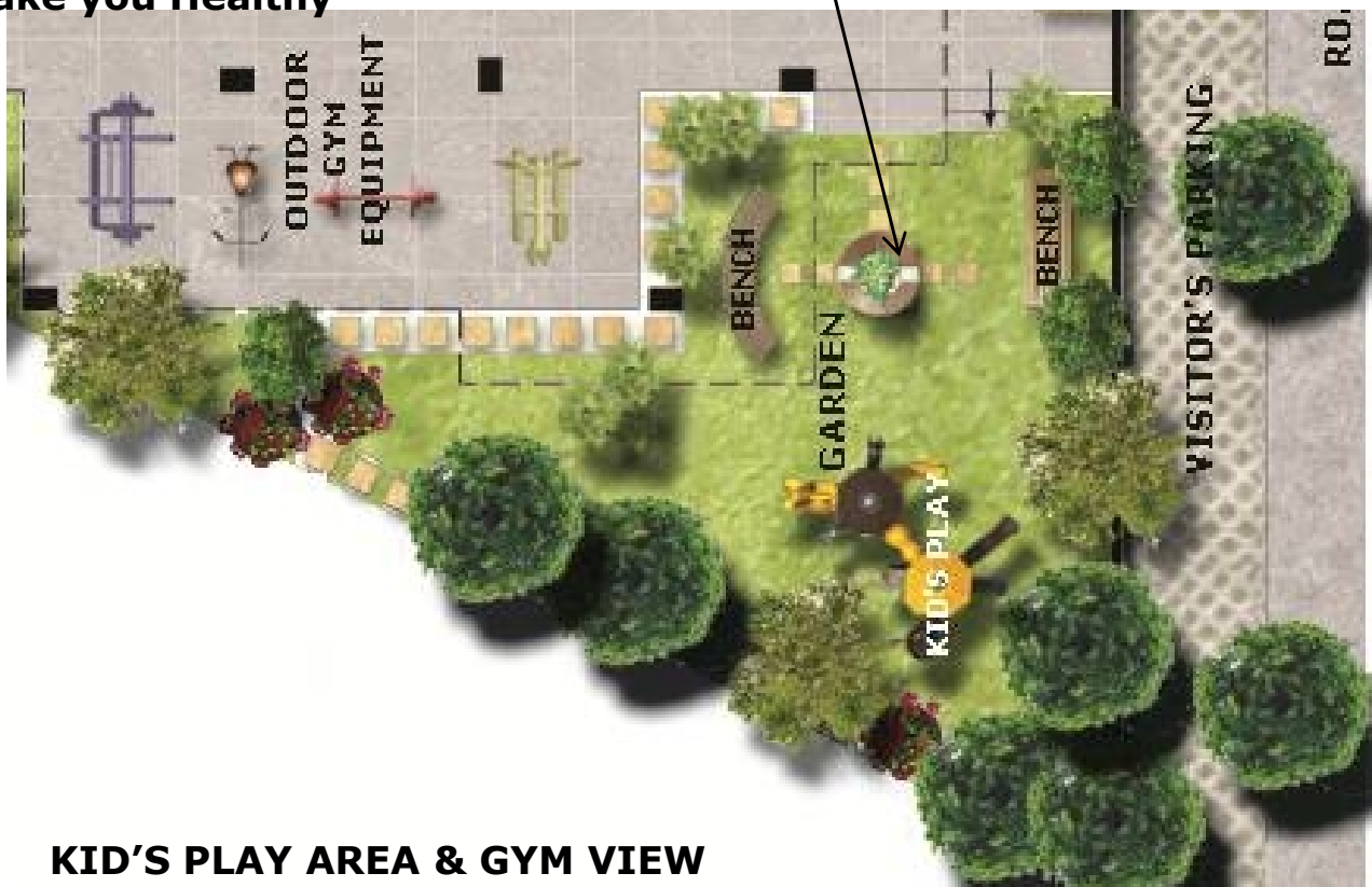
KID'S PLAY AREA & GYM VIEW C-12A, VIPUL WORLD, SEC-48, GURGAON