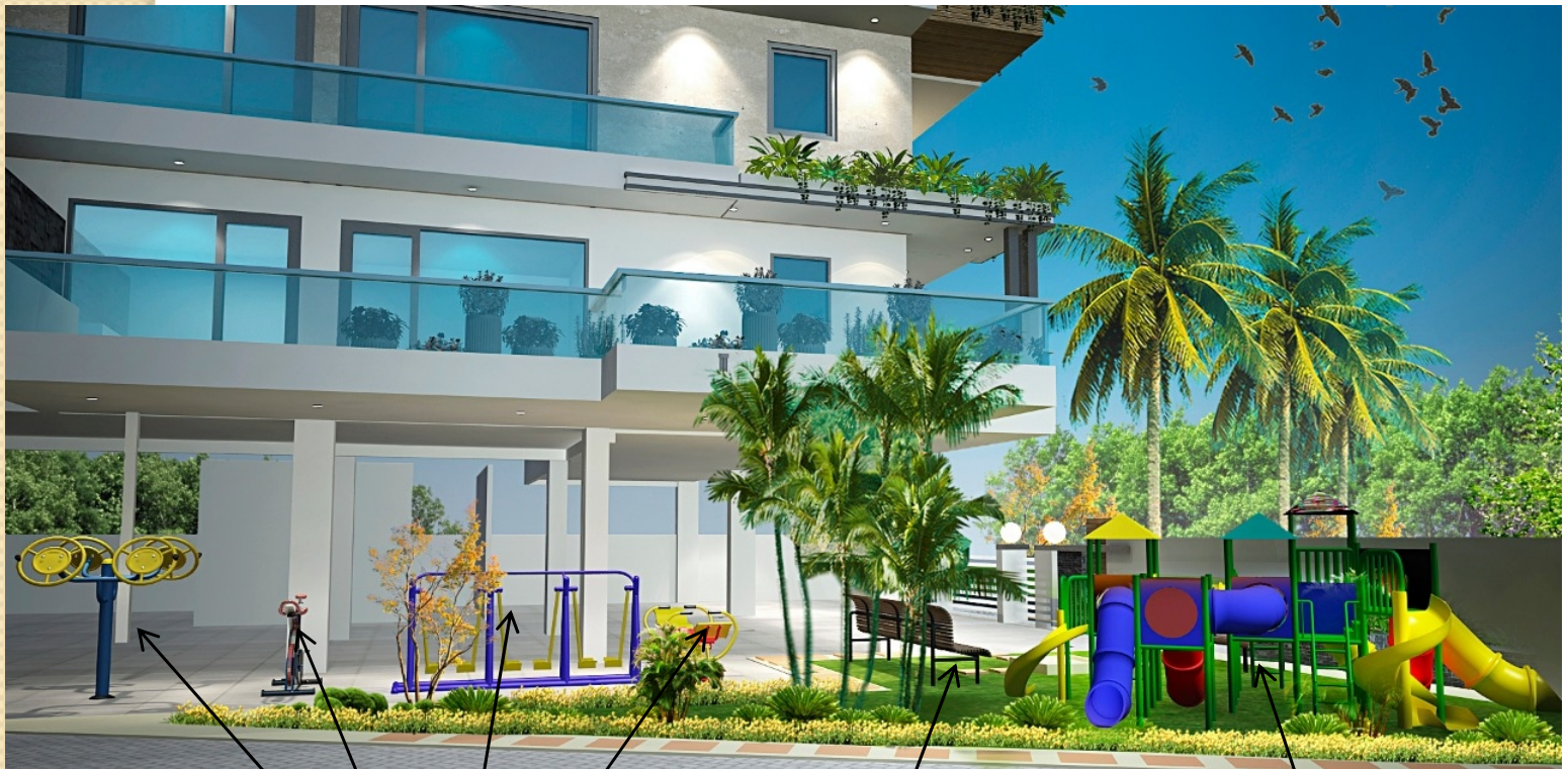
Outdoor Gym Equipments to Make you Healthy