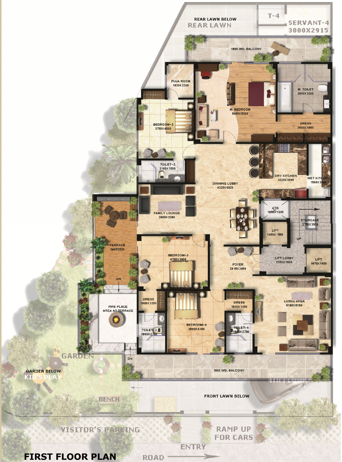
FIRST FLOOR PLAN C-12A, VIPUL WORLD, SEC-48, GURGAON