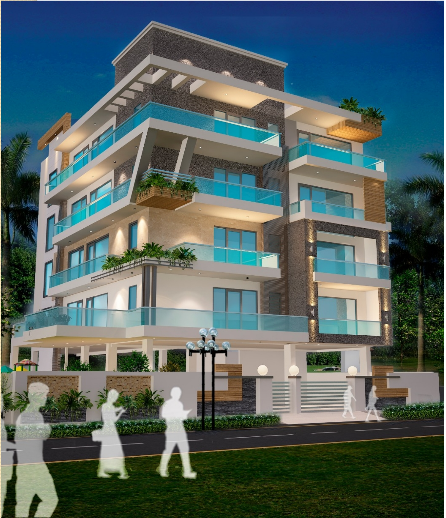
PROPOSED BUILDING DESIGN OF 571 SQYD. C-12A, VIPUL WORLD, SEC-48, GURGAON