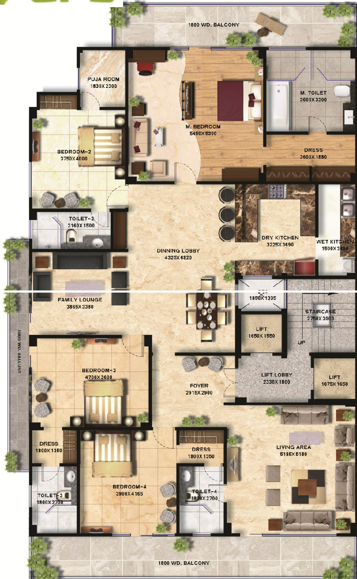
SECOND FLOOR PLAN (TYPICAL FLOORS) C-12A, VIPUL WORLD, SEC-48, GURGAON